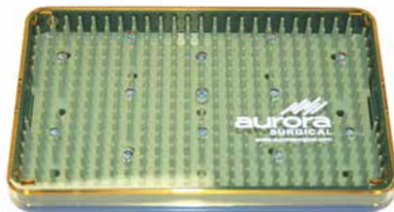
AS16-004 • 4.0" x 7.5" x 0.75"