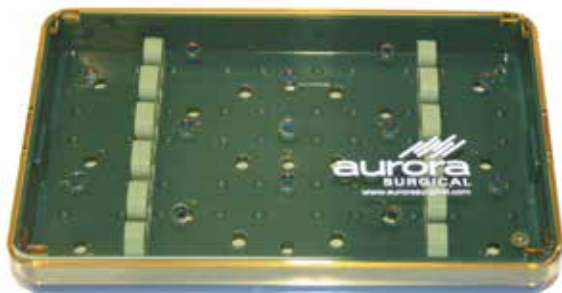
AS16-003-1 • 4.0" x 6.5" x 0.75"